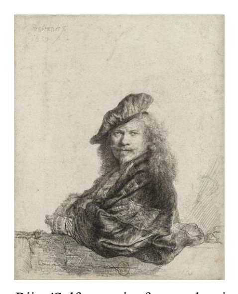
Figure 3. Rembrandt van Rijn. 'Self-portrait of a man leaning against a stone window

When submitting an illustration of a work of art, the numbering of the painting must be followed by the metrics of the work of art: the author, the title of the work, the year of creation. See Figure 3: